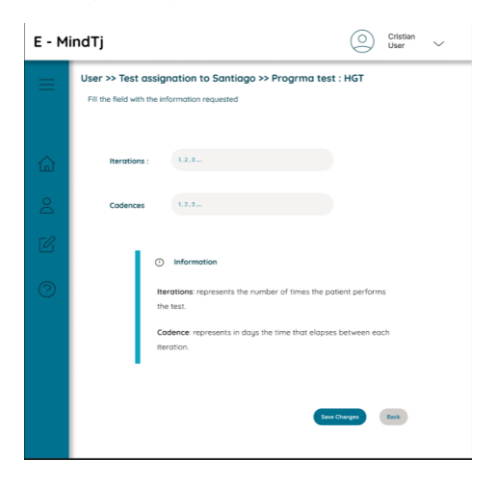
Figure 5. Test assignment

Figure 5 shows the test assignment to the patients, where the number of times the patient must perform the test (iterations) and the number of days that must elapse between each iteration (cadence) are selected.