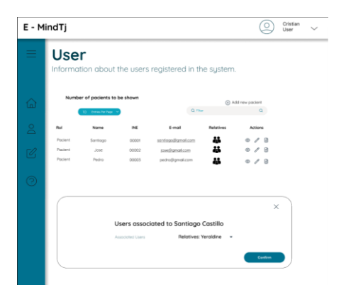
Figure 4. Patient-family relationship

Figure 4 shows the patient's relative or caregiver assignment information. This section allows us to associate family members to a given patient or vice versa. The window shows the users who are already associated to the patient and allows us to associate other family members who are not.