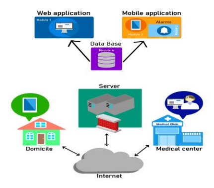
Figure 1. General Diagram

Figure 1 shows the general scheme of the project.